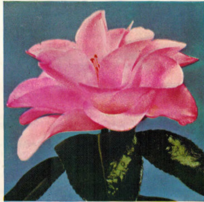
MAGNOLIAFLORA, See Page 10