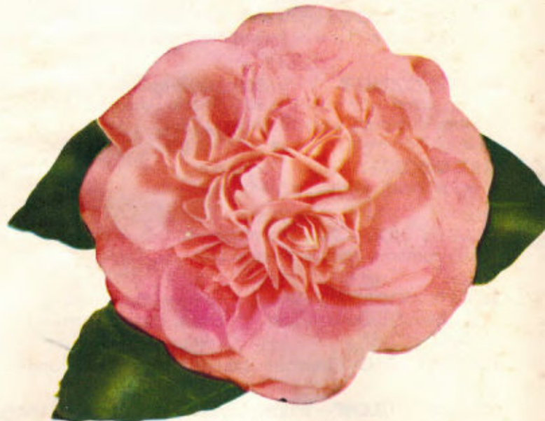
DEBUTANTE, See Page 18