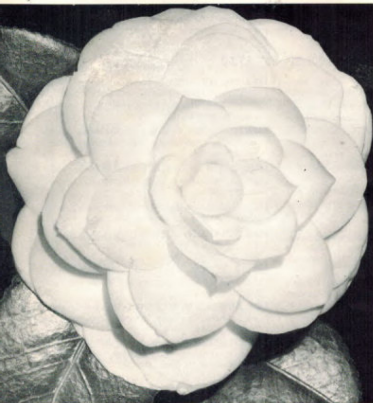
THOMAS PITTS, See page 16