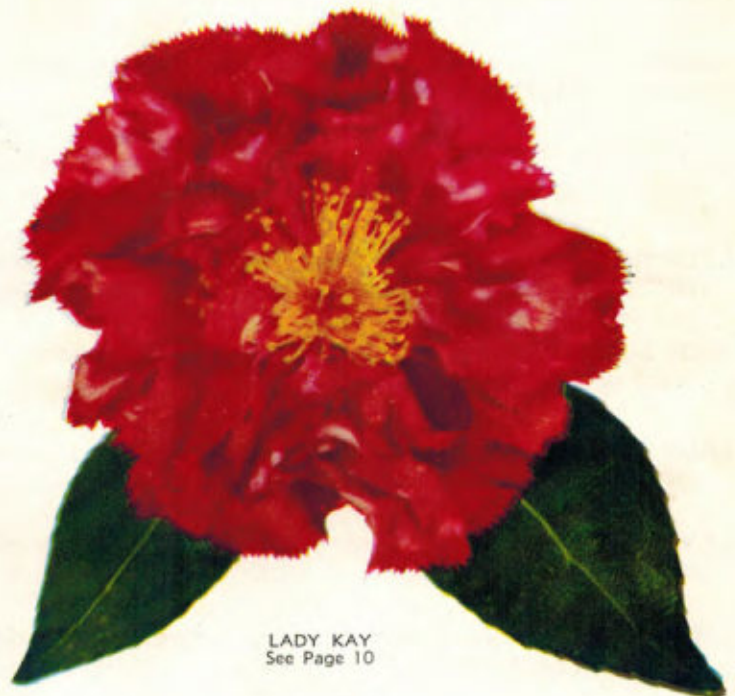
LADY KAY See Page 10