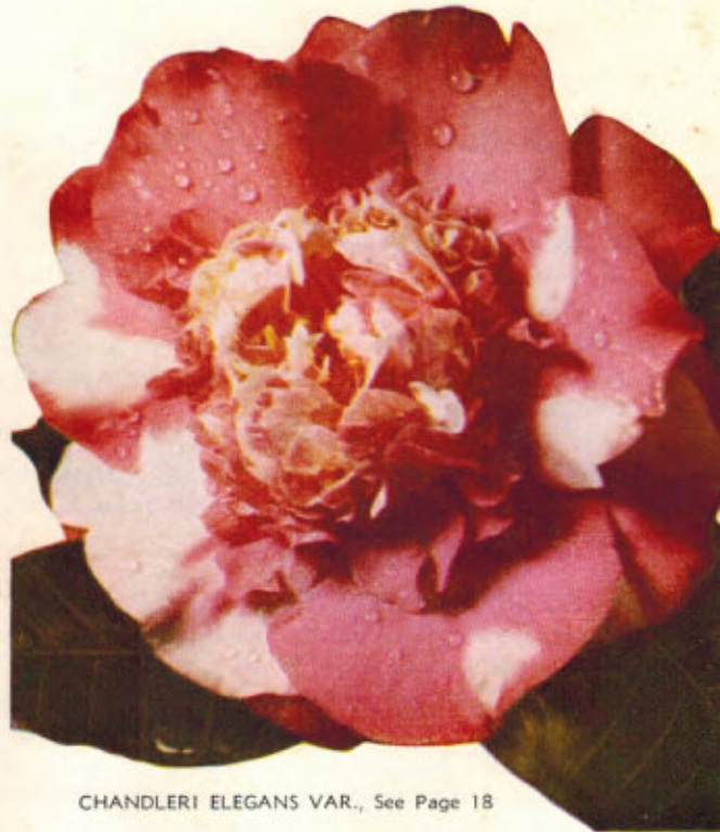
CHANDLERI ELEGANS VAR., See Page 18

Camellias offer the garden lover a wide variety of colors and forms. See these pages of color illustrations.