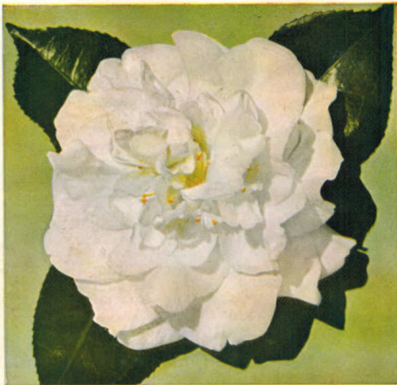
JOSHUA YOUTZ (White Daikagura), See Page 10

of Bottom row left to right, a rose form double, full peony, loose ne, peony, and another full anemone type. ble. Any or all of these types, or variations thereof, may be had in Camellias and make gorgeous garden displays.