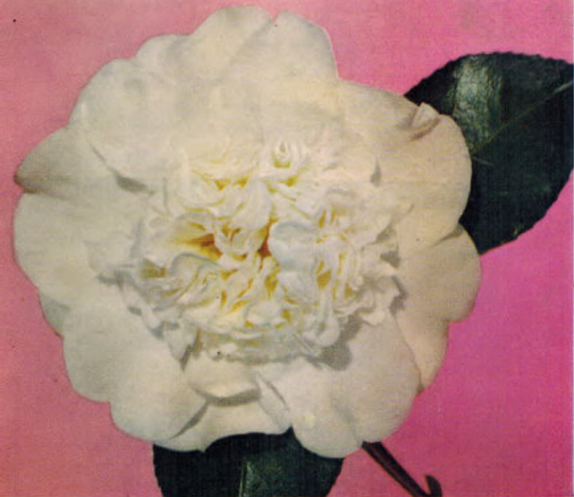
SHIRO CHAN, See Page 15