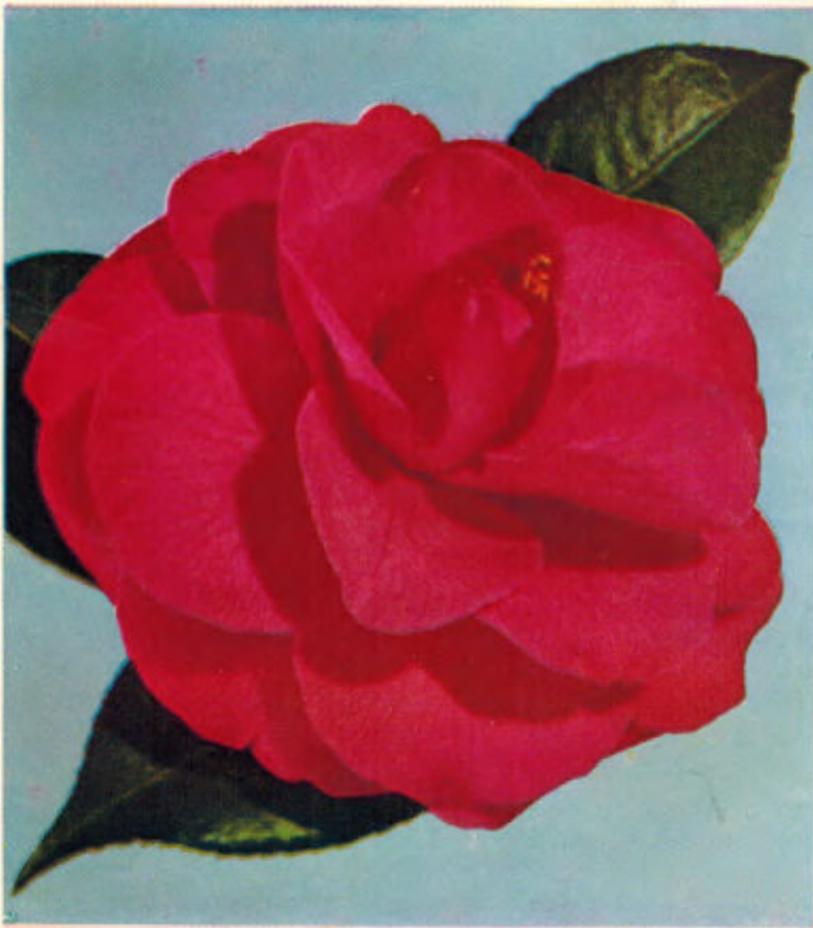
MATHOTIANA (Julia Drayton), See Page 18

Top row from left to right, a loose anemone, a full and formal double, a semi-double with fimbriated edges, and a formal double.