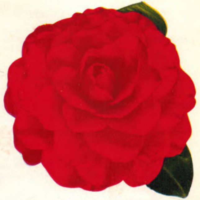
C. M. HOVEY (Colonel Firey) See Page 18

range of color, type and flower form as shown on