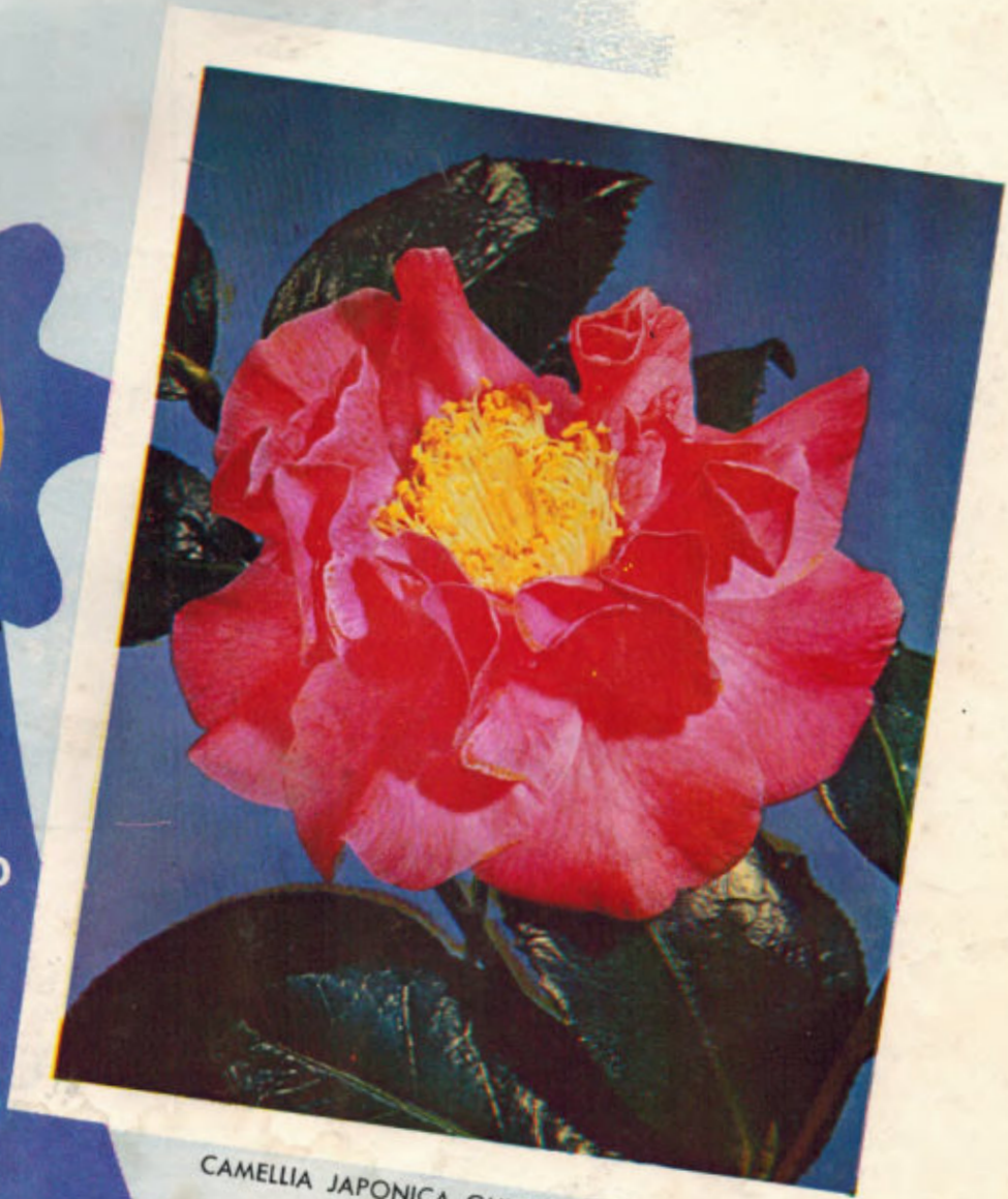
CAMELLIA JAPONICA GUILIO NUCCIO