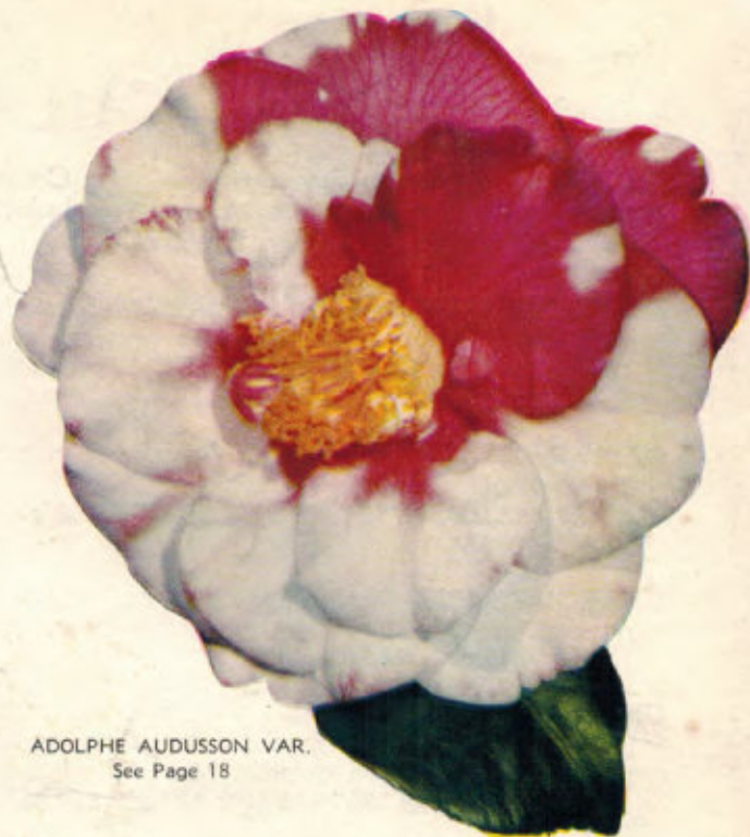
ADOLPHE AUDUSSON VAR. See Page 18