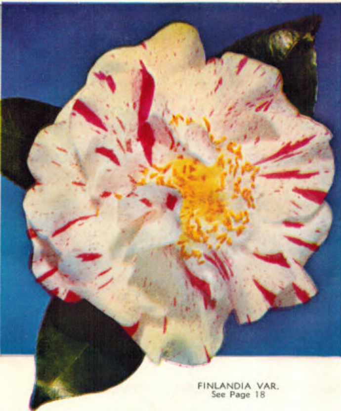
FINLANDIA VAR. See Page 18