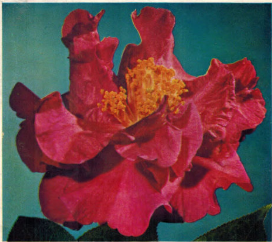
C. RETICULATA, CRIMSON ROBE, See Page 23