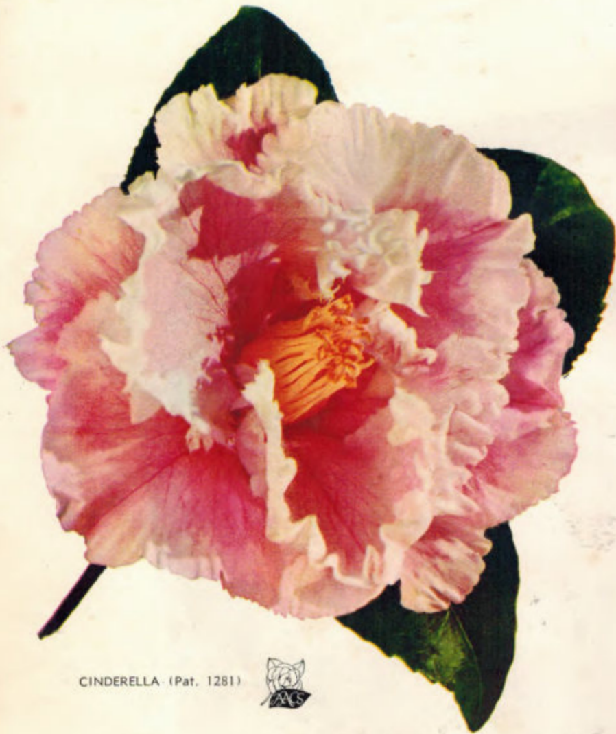
CINDERELLA (Pat. 1281)