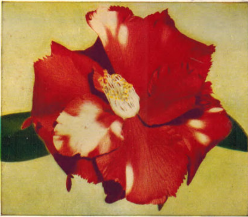
VILLE DE NANTES VAR., See Page 17