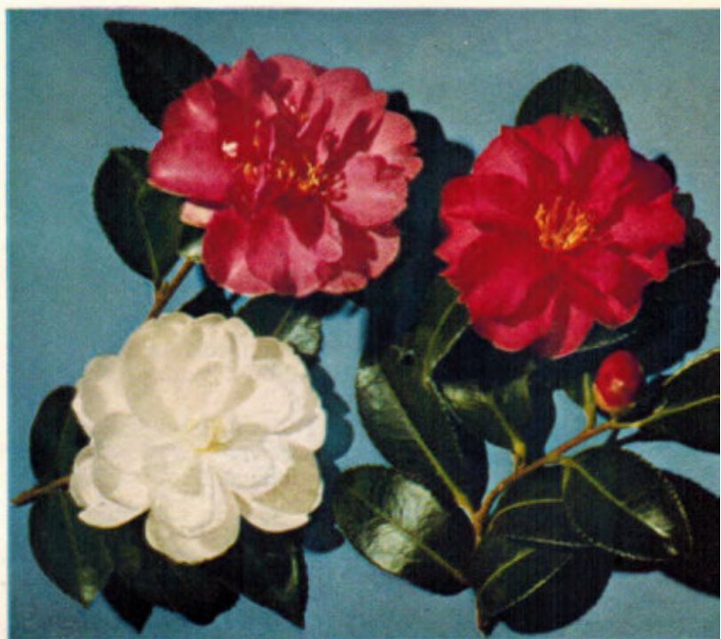
C. SASANQUA GROUP