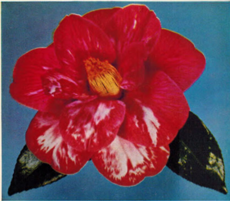
DONCKELARI, See Page 7