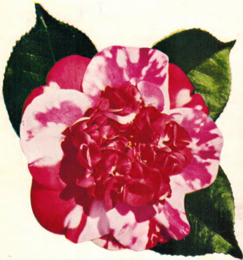
GIGANTEA (Emperor Wilhelm), See Page 18