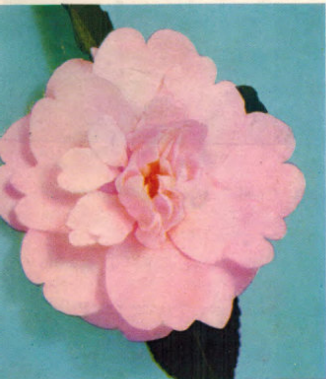
C. SASANQUA, JEAN MAY, See Page 20